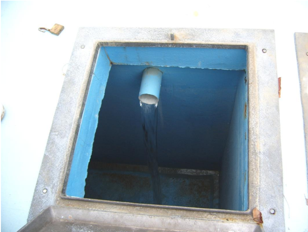
THE CISTERN HOLDS 10,000 GALLONS OF WATER